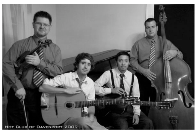
Hot Club of Davenport